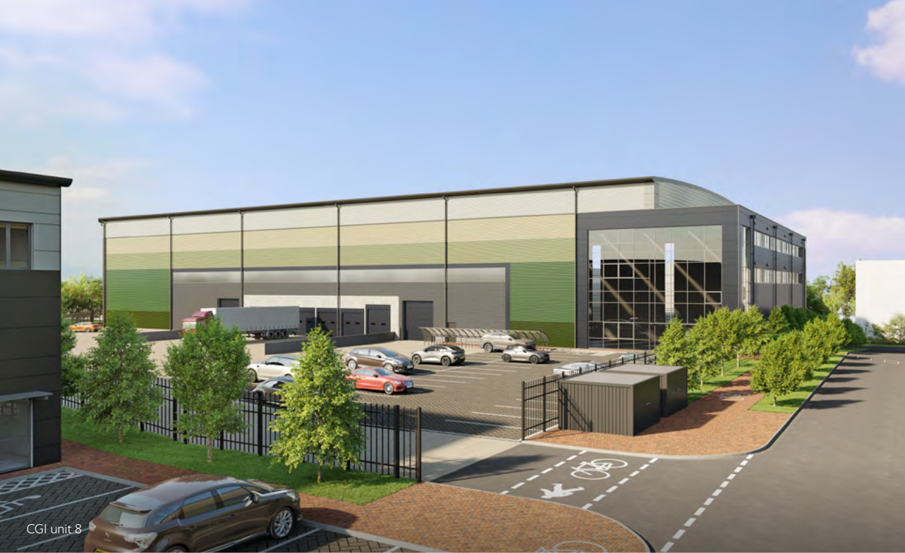
CGI unit 8