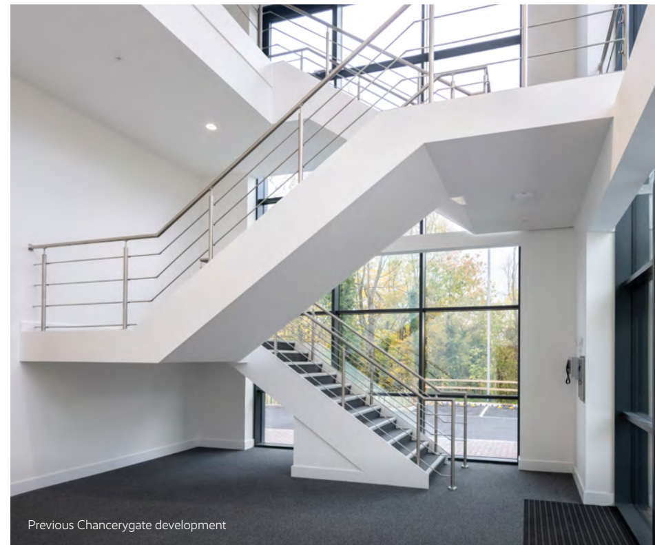
Previous Chancerygate development