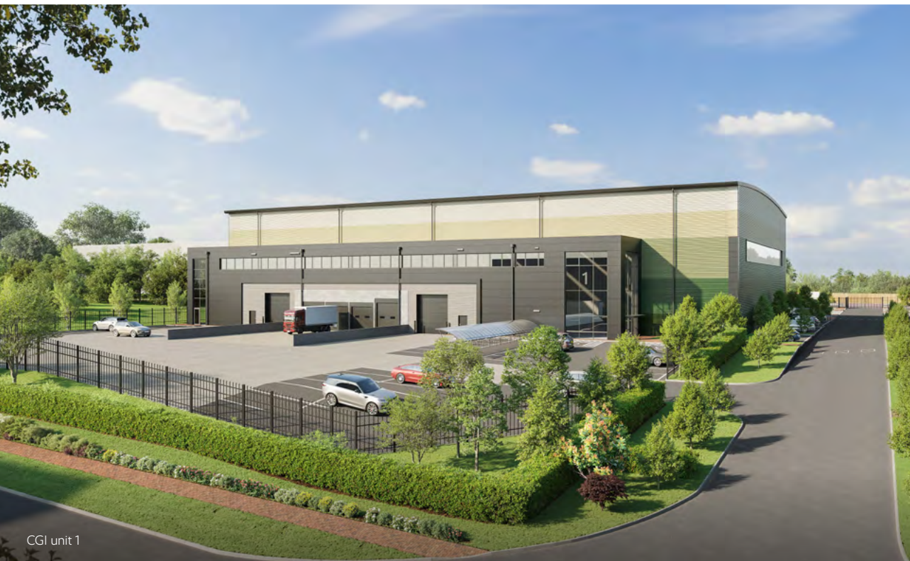
CGI unit 1