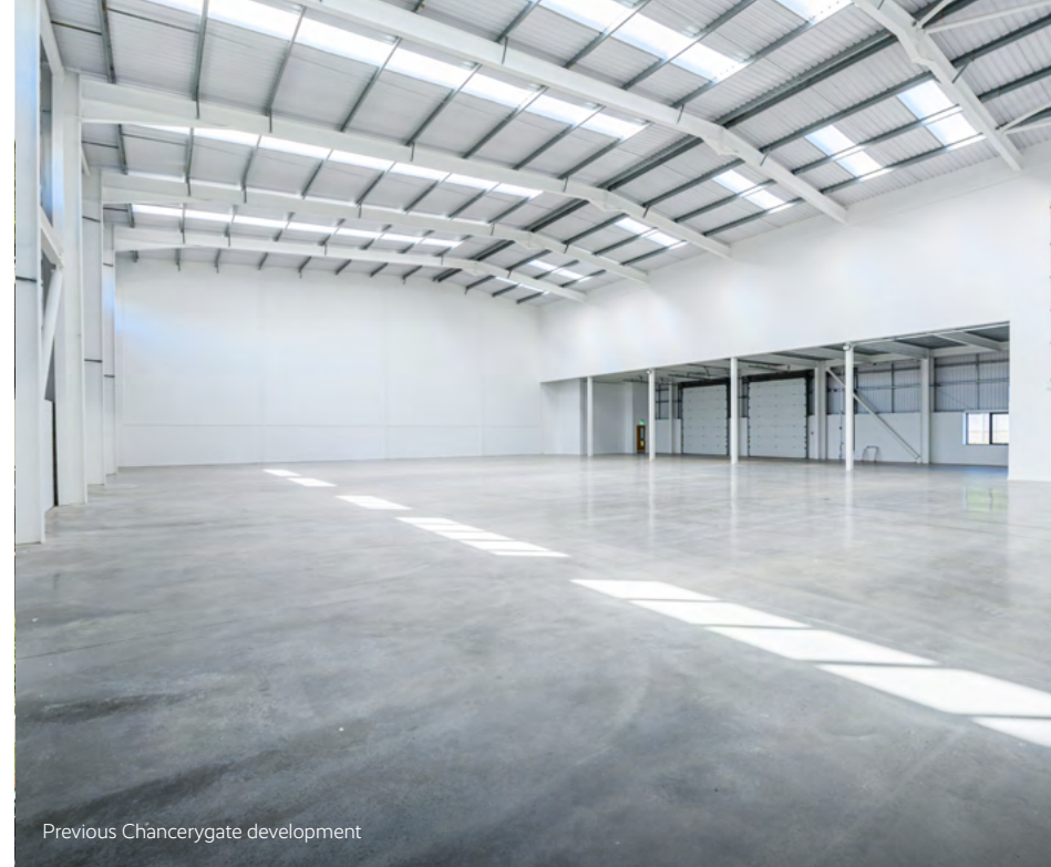
Previous Chancerygate development