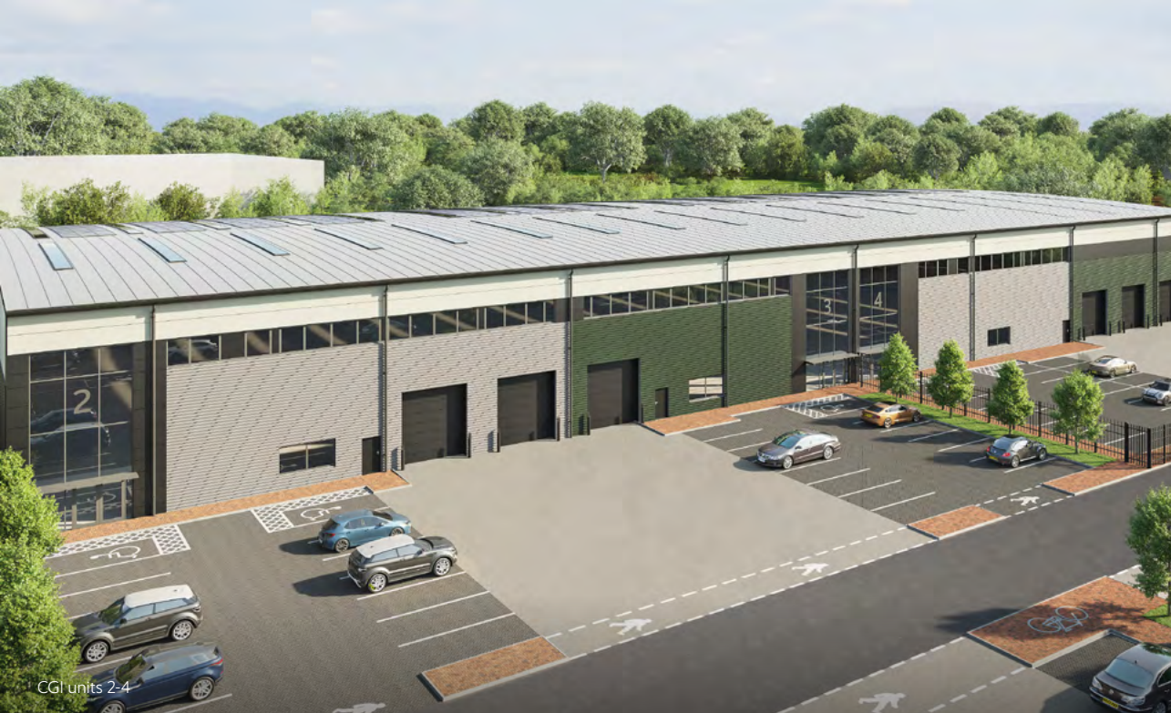
CGI units 2-4