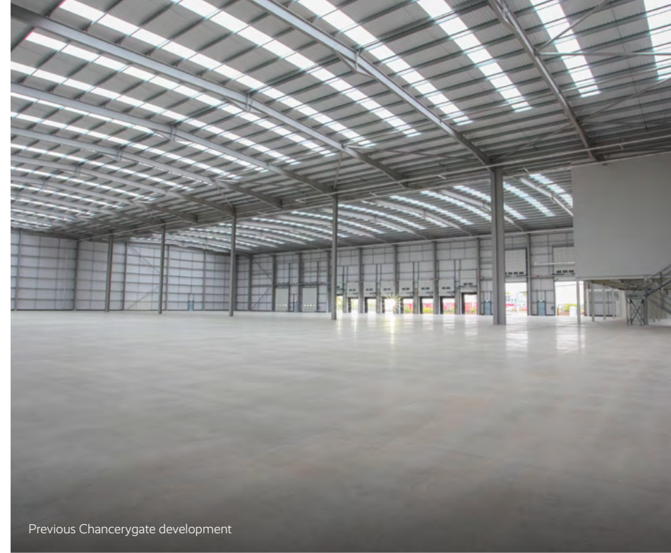
Previous Chancerygate development