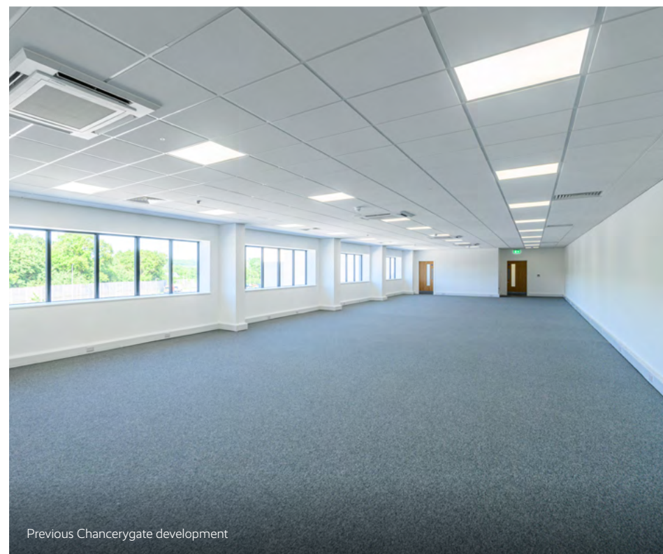
Previous Chancerygate development