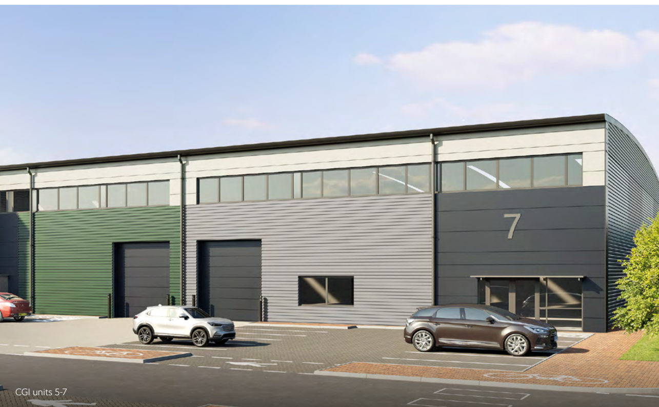
CGI units 5-7